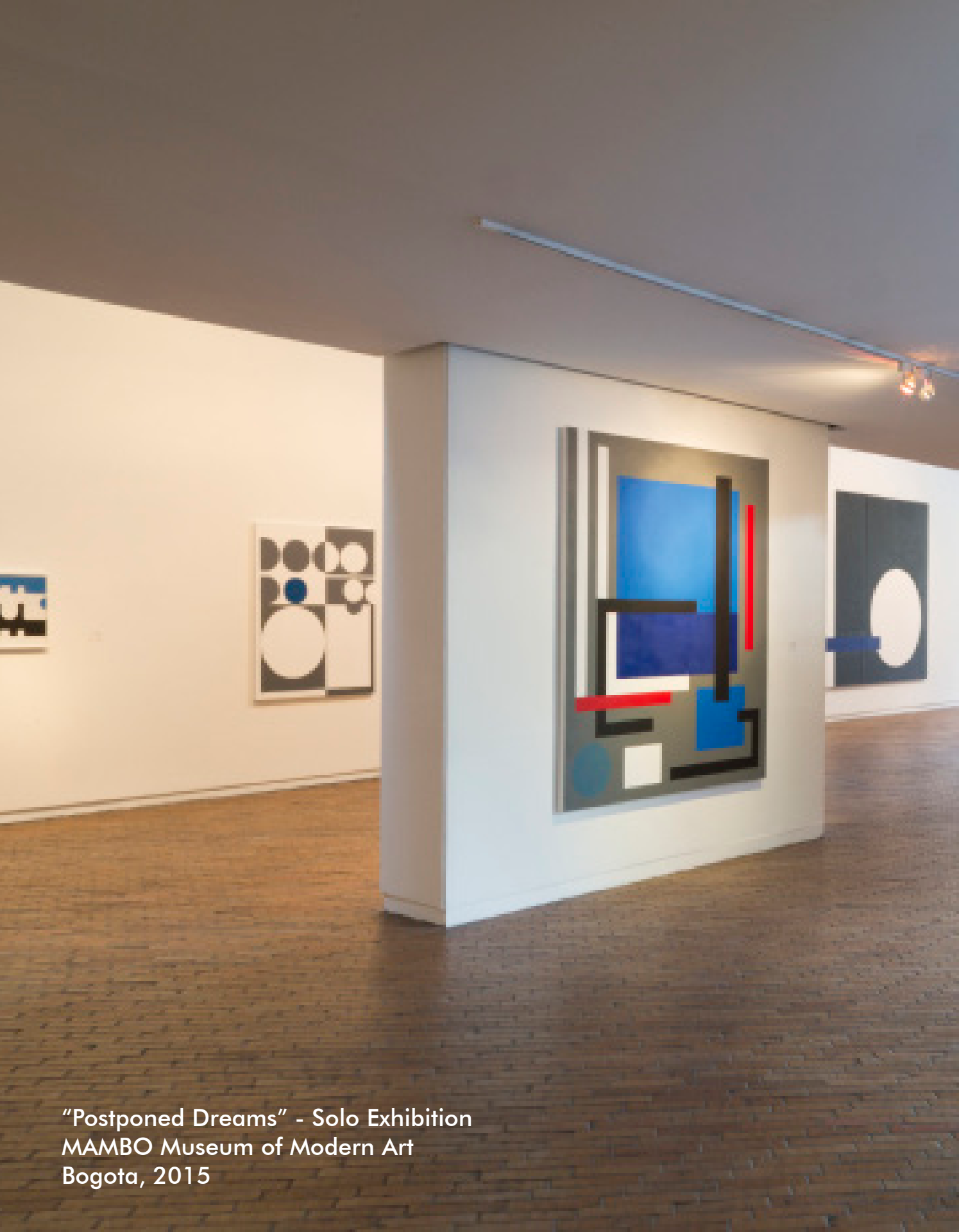
"Postponed Dreams" - Solo Exhibition MAMBO Museum of Modern Art Bogota, 2015